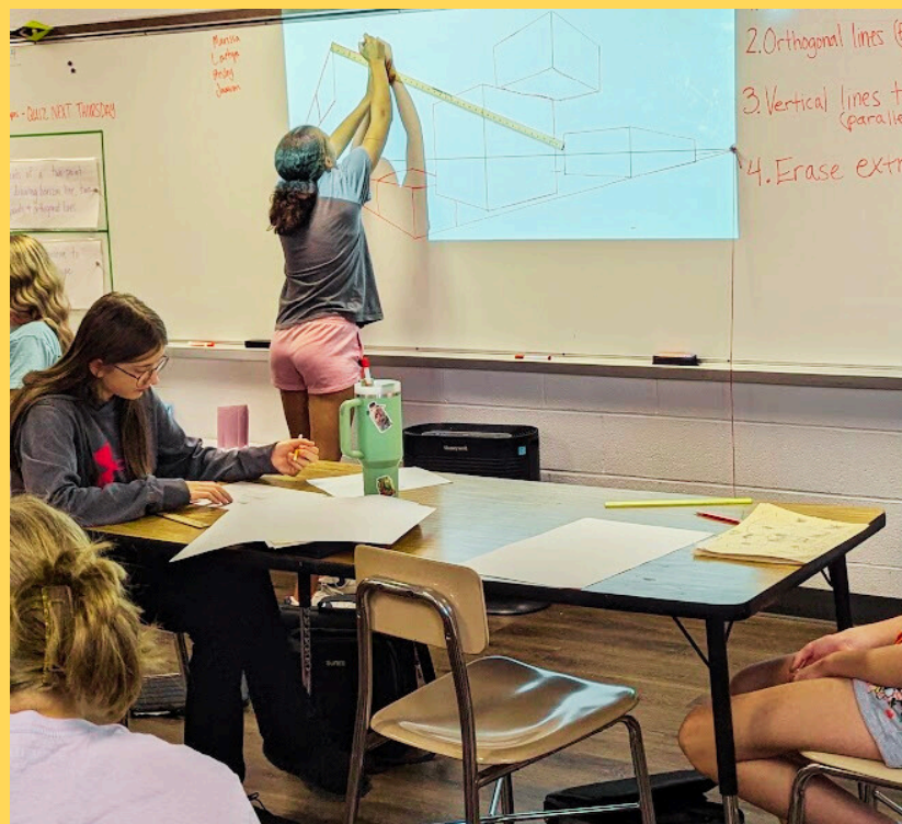
Practicing two-point perspective

6th, 7th, and 8th graders are exploring how perspective is used in art. 6th graders began their one-point perspective room drawings while 7th/8th graders got started on two-point perspective "fantasy-scapes."