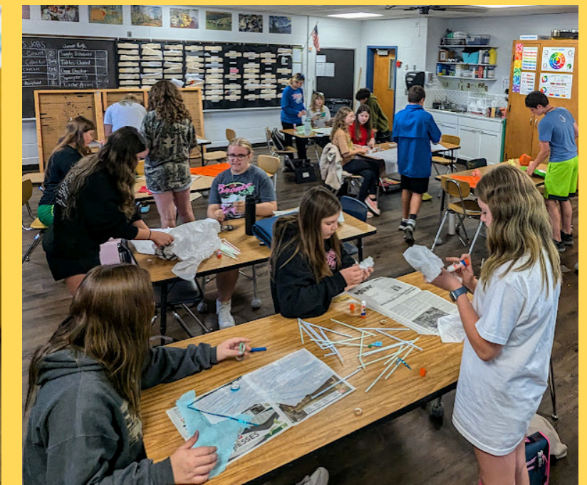
Students worked together in the latest Art Chopped challenge: Under the Sea