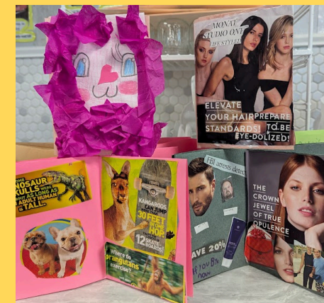
5th Grade Zines